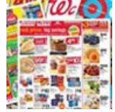
SEE THE WEEKLY ADS FROM THE SUNDAY TRIBUNE