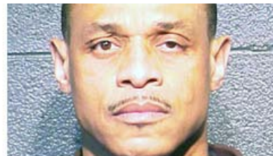
Used ab tattoo as threat