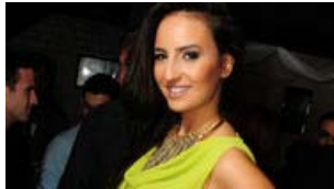
Style tips from Chicago nightclubs