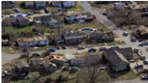
Deadly storm in southern Illinois