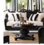
POTTERY BARN'S ROOM DESIGN GUIDE