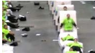
850 human dominoes try to set world record